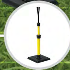
Square It Up Tee