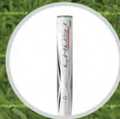
Ghost ® Advanced