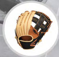
Pro Collection Ball Glove