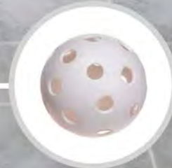
Plastic Training Ball