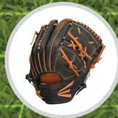
Pro Collection Ball Glove